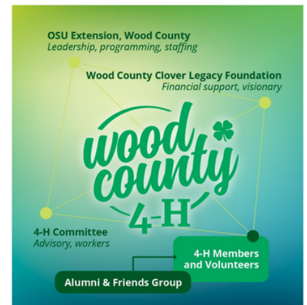
Our Organization Relationship